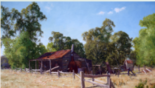
“Faded Dreams” Pyrenees Area, VIC 75 x 102cm

For over 200 years, we have shared and further developed these strong spiritual forces with the land and sea which are quintessentially Australian – going to the bush or the sea/beach are meaningful, often unspoken but well understood. Capturing these moods and feelings on canvas has been the quest of painters in Australia.