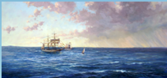
Meeting the "Shandon" Port Philip, VIC 89 x 183cm