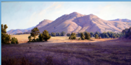
"Lavender Light" Near Gundagai, NSW 76 x 152cm