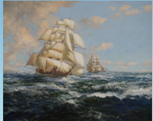
“Forging a Lead – Working the Elements” 61 x 76cm