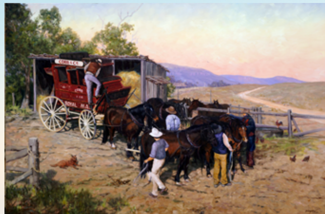
Changeover Station, Cobb & Co., Royal Mail - 102 x 152cm

"SPIRIT OF PLACE - SEARCHING FOR THE STORY"