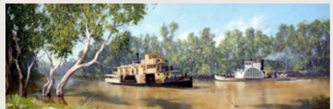
“Old Work Mates” Murray Banks, VIC 46 x 137cm