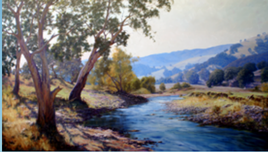
“Autumn Paradise” Gilmore Valley, NSW 122 x 213cm

From the original settlements across our ancient Island home, Australians have forged strong bonds with its land and sea. These spiritual connections are legendary in our Aboriginal culture. A land for all to share - we are known to be the “lucky country”.